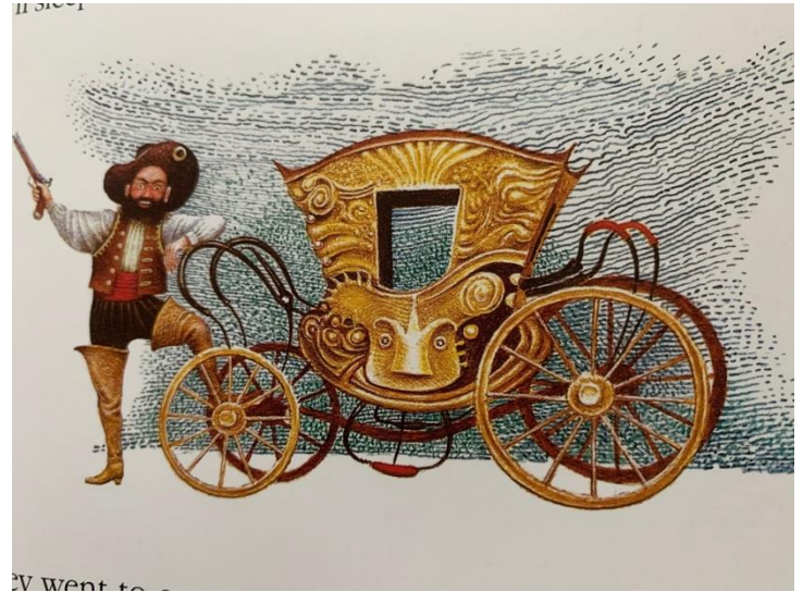
IV went to

"They won't harm you as long as I'm not angry with you," she said. "I suppose you are a princess?"