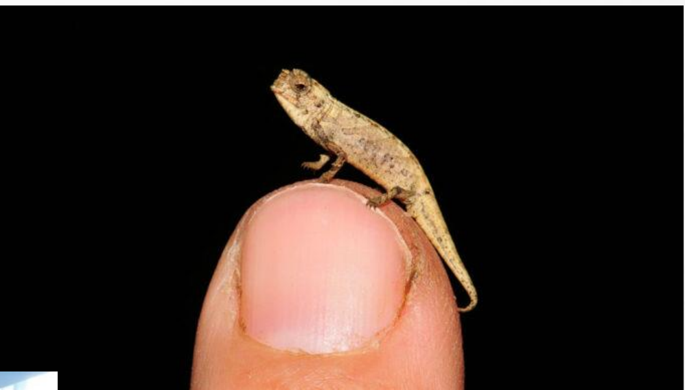
World's smallest reptile discovered