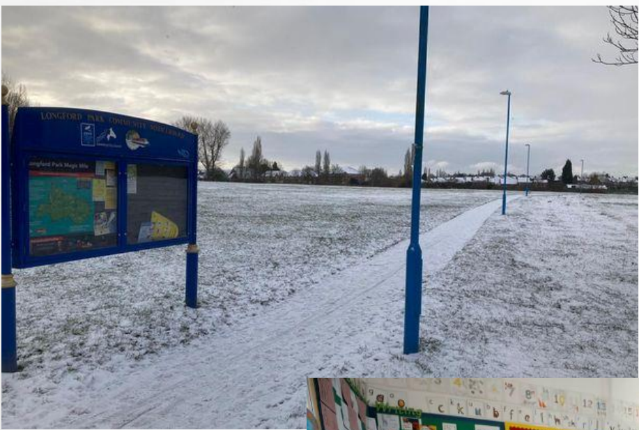
Snow in Longford park