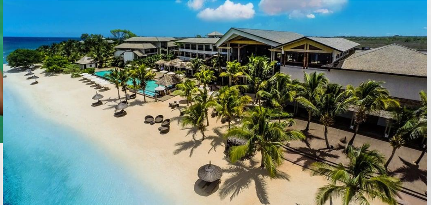
The Grand Hotel-Smith's family holiday accommodation