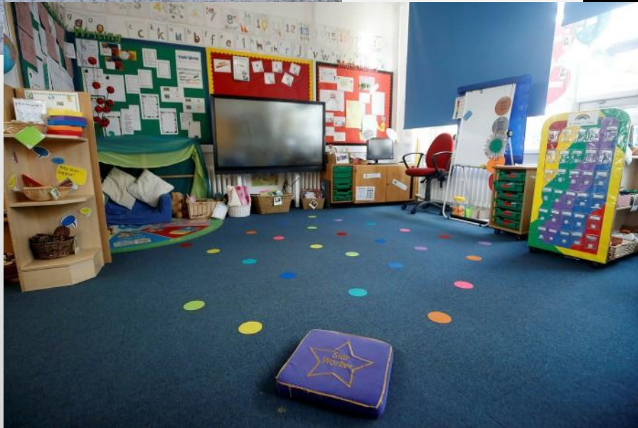
New furniture in one of Green Hills School's classrooms