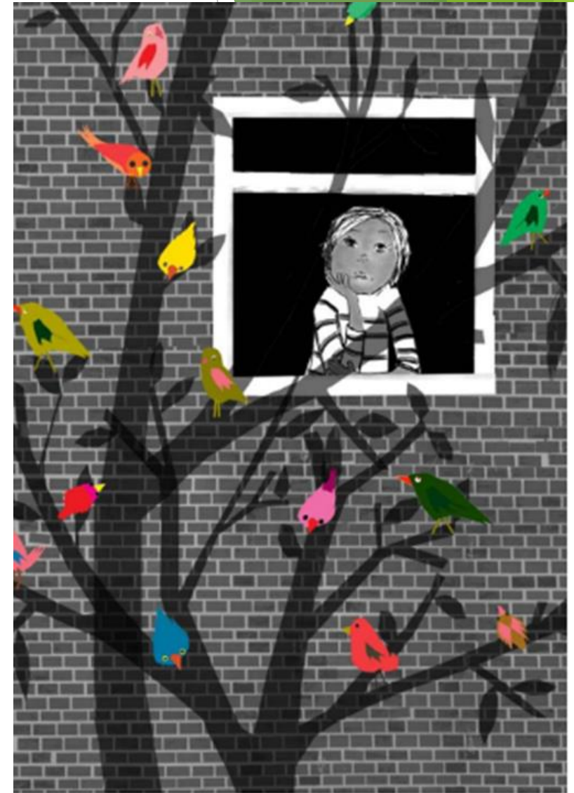
The World Through a Window Copyright © Lauren Child 2020

Why do you think Lauren Child called this picture 'The World Through the Window'?