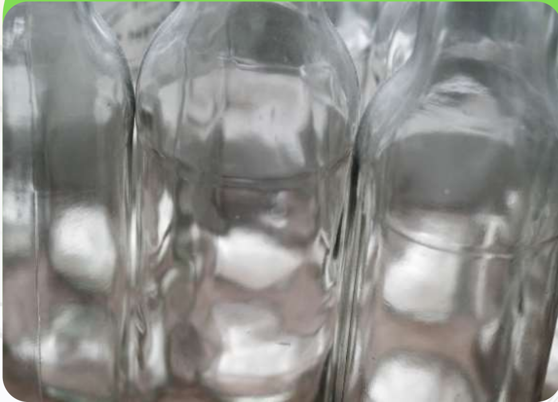
granted under creative commons licence – attribution